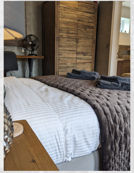
Finally, our third room, Partridge, is a 2 bedroom Family Suite with a King Size bed and bunk beds, this suite sleeps up to 4 people. The bunk beds are full size and will accommodate adults or children.